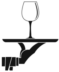
Table Service & Tabs

We are here to look after you. Unfortunately there is no service at the bar. However, you'll be allocated a table and a staff member to take care of your orders.